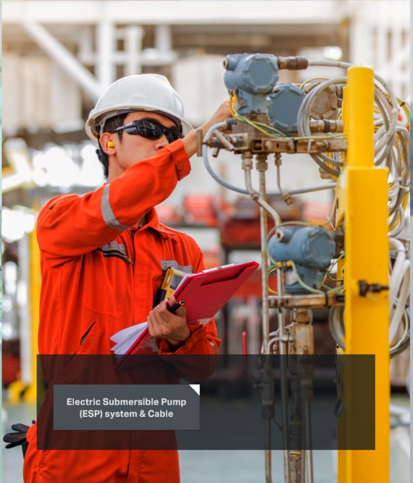
Electric Submersible Pump (ESP) system & Cable